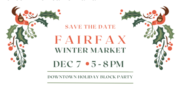
Rain date: Dec 14

Join the Fairfax Chamber of Commerce for their Fairfax Winter Market – A Magical Holiday Experience! The Fairfax Winter Market is a family-friendly event that captures the essence of the holiday season, providing a perfect opportunity to connect with friends and neighbors while celebrating the joys of winter. Don't miss this chance to make cherished memories in the heart of Fairfax.